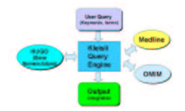
Figure 2: An " in silico discovery kit" that uses an available ontology data source to get around the problem of inconsistent naming in genes and proteins, and integrates information across multiple data sources.