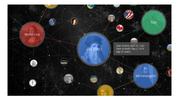
Fig. 1. Google Knowledge Graph

Existing research efforts (e.g., [2], [3]) often try to obtain knowledge from mass social media contents by summarizing the data, extracting trending topics or even making predictions. Unfortunately, many people, including ordinary and corporate users, tend to have more interest in only topics or events within certain context instead of the globally significant ones. Although some researchers alleviate the problem by introducing constraints, such as allowing keyword filtering [4] and focusing on contents published in specific geographic areas [5], users may still find the discoveries pointless in terms of their preference. Consider, for instance, the scenario where a tourist is going to visit a place that he has never been to before, or an investor plans to buy stocks of a certain company. It would be greatly beneficial if both of them have access to some well organized and continuously updated knowledge regarding how other people talk about their targets, and furthermore, if they can also obtain such knowledge of a few more closely related entities via an information network.