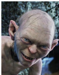
(b) Realistic character.