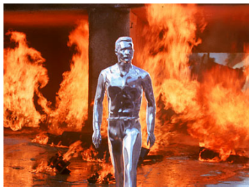
(b) Terminator 2 (1991)