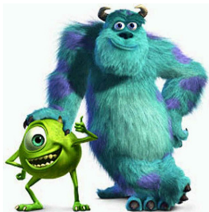
(a) Cartoon characters.