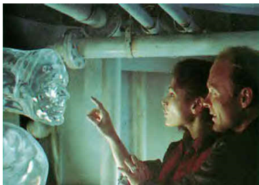
(a) The Abyss (1989)

Digital special effects (VFX) became available in 1990s and have revolutionized media industry.