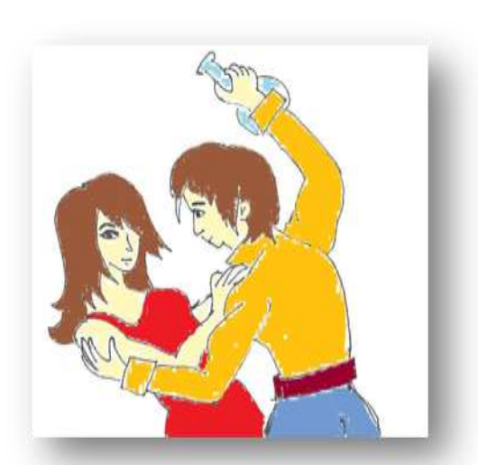
The Super Hero saves the girl and the bottle