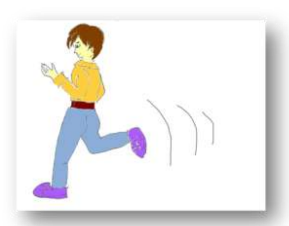
The Super Hero zooms fast at high speed.