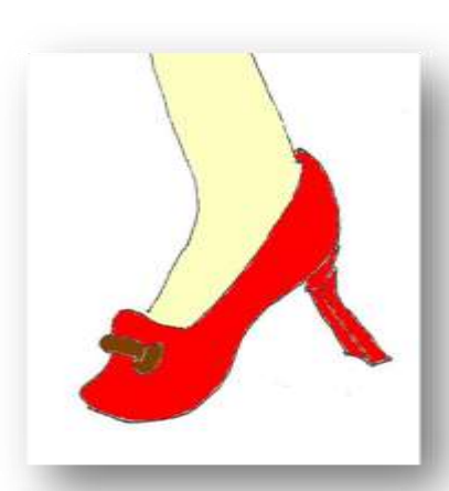
Her heel broke