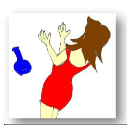
The super hero freezes the time. The bottle is still in midair when he arrives at the scene.