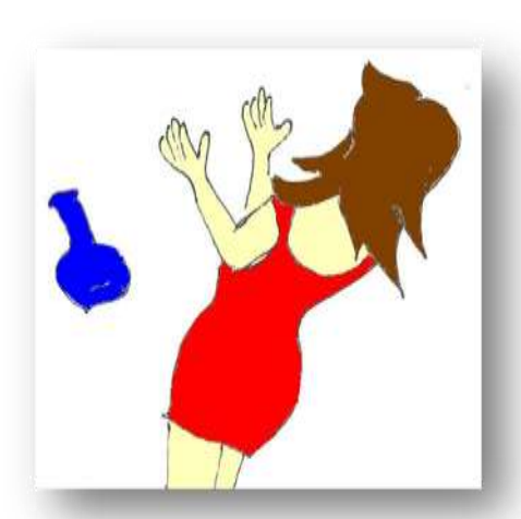
She's about to fall down, and the bottle is about to shatter