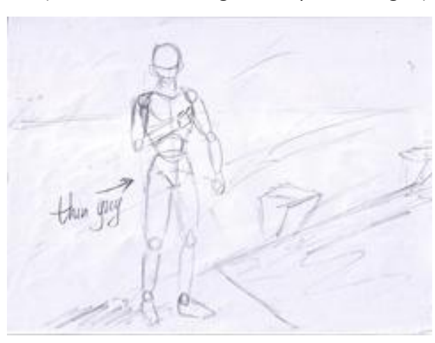
3) The girl looks at the thin guy. (Wide shot)