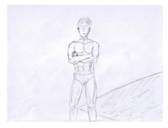
12) He stands up and turns to a very strong guy. (Mid shot)