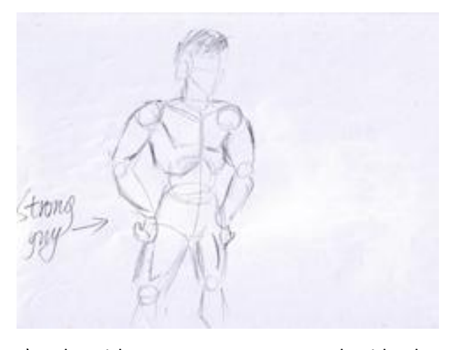
4) The girl turns to a strong guy beside the thin guy. (Mid shot)