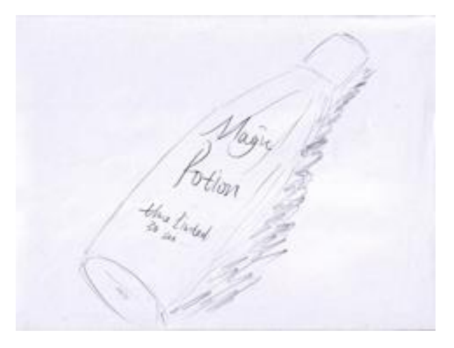
14) The bottle with the name "Magic Potion". (Close up shot, show the words "time limit: 30 sec")