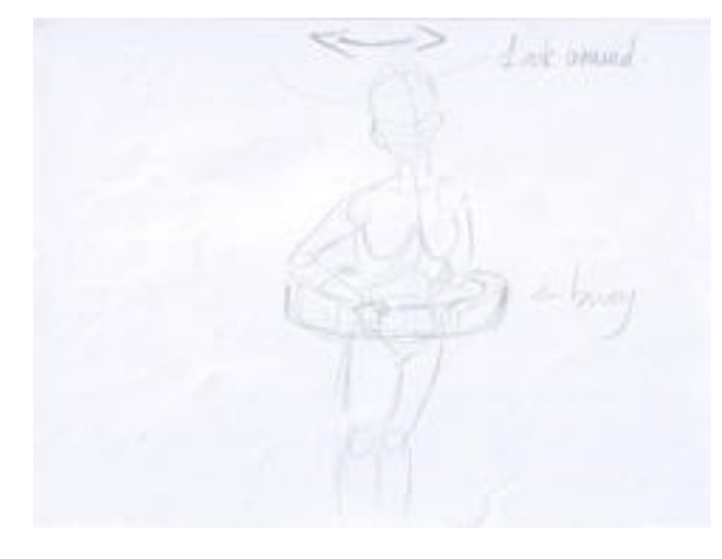
The girl with a buoy is also looking around. (Mid shot)