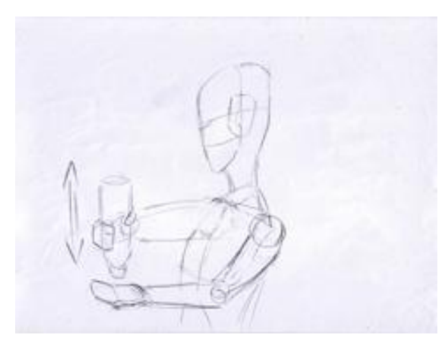
8) The guy spills the liquid to his hand. (Mid shot)