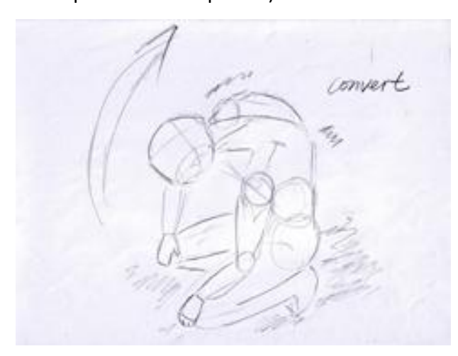
11) Then he squats and is converted by the potion. (Close up shot, muscle expanding)