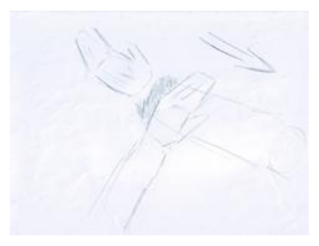
9) He puts the liquid on his arm from wrist to elbow. (Close up shot, the arm starts to expand with the potion)