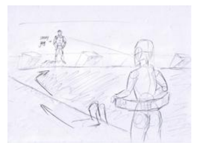
5) She chooses the strong one, walks to him. (Wide shot, until the girl reaches the guy)