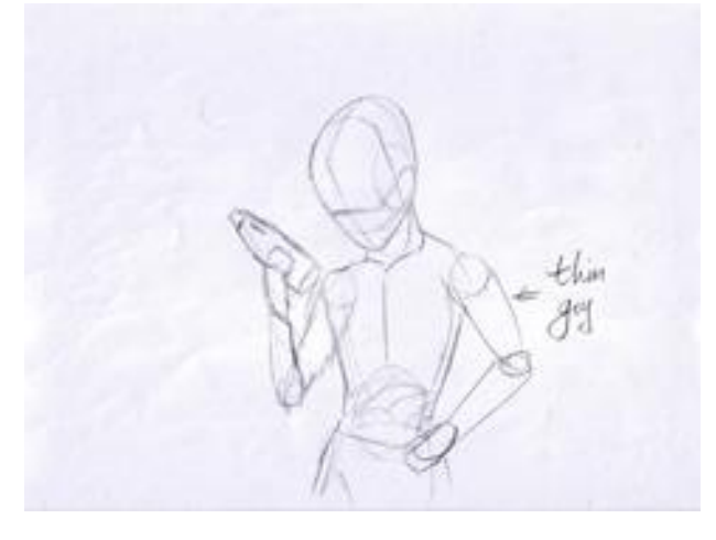
6) The thin guy is jealous and takes a bottle from his bag. (Mid shot)