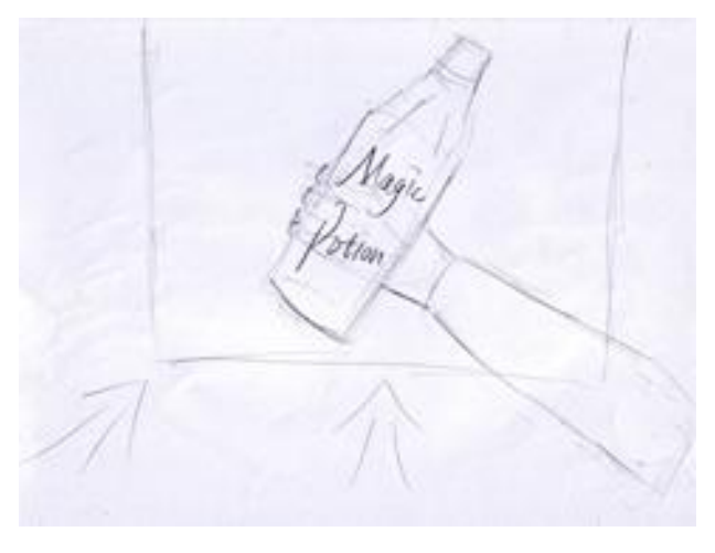
7) The bottle with the name "Magic Potion". (Close up shot, zooming in to capture the name)