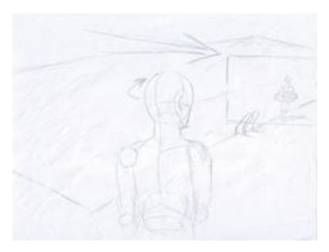
The thin guy looks around to find the girl. (Wide shot, zooming in to capture the girl)