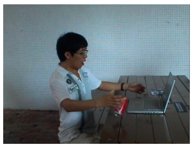
Figure 4: Shocked Actor A