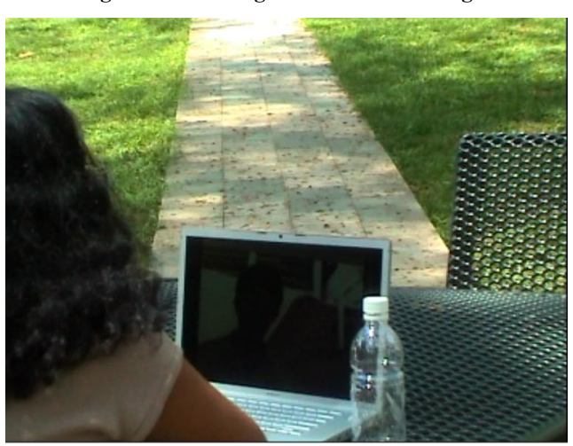
Figure 6: Chatting from Actor B's Angle