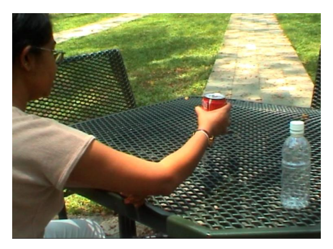
Figure 8: Getting Drink from Actor B's Angle