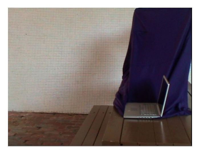
Figure 2: Laptop with Blue Background from Actor A's Angle