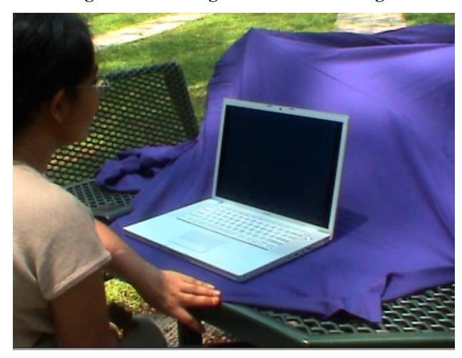
Figure 7: Laptop with Blue Background from Actor B's Angle