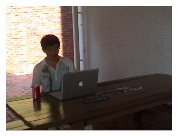
Figure 5: Chatting from Actor A's Angle