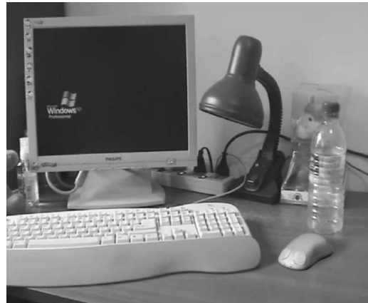
2) A mouse near the keyboard