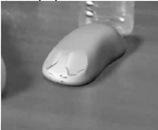
3) Close-up shot of mouse.