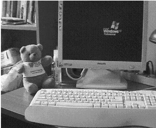
1) A sunny day.