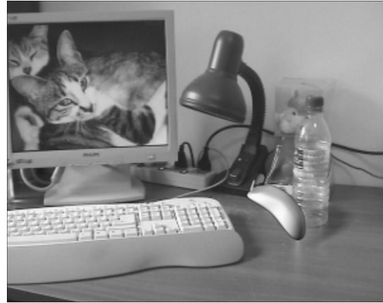
7) Mouse jumps to the front of the bottle. 8) Mouse sees the cat and scared.