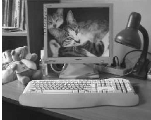
9) When mouse notices cat does not move. 10) Mouse goes to play with teddy bear. So it happily plays around.