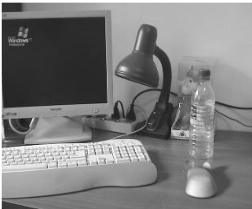
5) Mouse starts to move