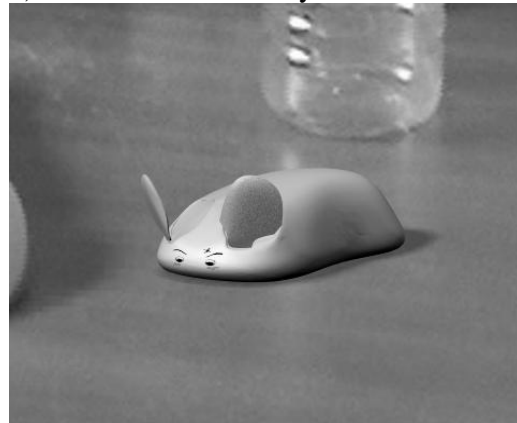
4) Mouse becomes alive