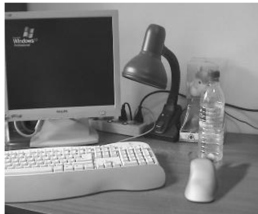
6) Mouse stands up and sees the bottle