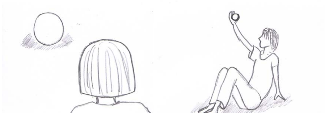
3. MCS Shoot the moon over actor's shoulder.