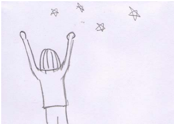
9. WS. Show the stars.