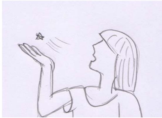
8. MCS. Side view shot. Actor blows the stars back to the sky.