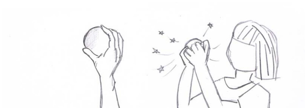
5. CUS of her hand. Actor picks up the moon.