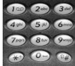
Figure 1: Standard ISO mobile phone keypad. Alphabetic letters are mapped to keys '2' through '9'.

There are currently two main methods that are usually used on mobile phones for text entry. They are the multi-tap method and the predictive text entry method. In the multi-tap method, a user taps the key that contains the letter repeatedly until the desired letter appears. The number of taps required depends on the position of the letter on the key. For example, a user can tap the 2-key once to get 'a', twice to get 'b' and thrice to get 'c', as shown on the standard keypad in Figure 1.