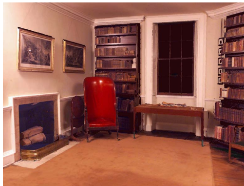
Figure 1. The Monticello library. We created this 3D model, for use in the Virtual Monticello exhibit, with a laser scanner and digital camera.

referred the NOMA curators to us. We forged a collaboration that provided us with an opportunity to demonstrate some of our research results to the public. NOMA also profited from the partnership, receiving two exhibits that offer 3D views into Jefferson's home. The first, which the museum titled Virtual Monticello (Figure 1), is a life-sized rear projected virtual environment. The second, Jefferson's Cabinet , is a barrier stereogram cre-