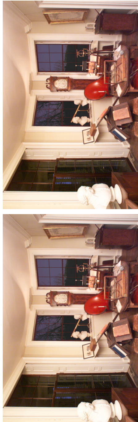
Figure 8. Jefferson's cabinet exhibit stereo pair. View this pair of images "cross eyed".