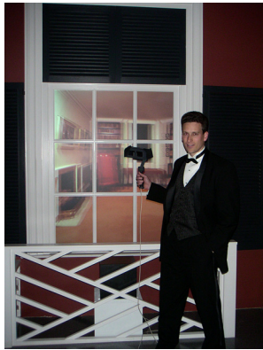
Figure 4. This image shows one window of the Monticello facade where the Virtual Monticello exhibit was installed.

ously invented [8]. This scanner captures very accurate and dense range samples, which we merged into a unified mesh using the iterated closest point algorithm. We texture mapped the model with color images taken from the DeltaSphere’s center of projection [7]. Then, we simplified the mesh to facilitate interactive rendering. Finally, we enlisted the help of a local artist to clean up the model by filling holes and fixing certain texture maps. Figure 1 is an example rendering of the completed library model.