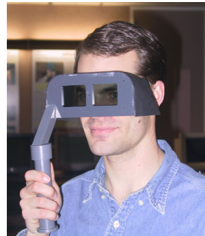
Figure 5. The stereo glasses were custom designed for this exhibit and constructed from PVC material. The bridge piece keeps the device away from the eyes to thwart eye infections and a rubber skirt keeps out stray light.

We opted for a handheld “opera glasses” design inspired in part by a 19 th century stereopticon; additionally, we built six special pairs of glasses that house tracker sensors. The handheld design and bridge piece, which extends to touch the forehead, helps to keep the lenses away from the eyes and thus reduces the likelihood of spreading conjunctivitis. A rubber skirt is used to keep stray light out. The heavy PVC material makes the glasses resistant to the abuse that is inevitable in a museum environment. We also provided instructions to NOMA for cleaning the glasses with mild soapy water.