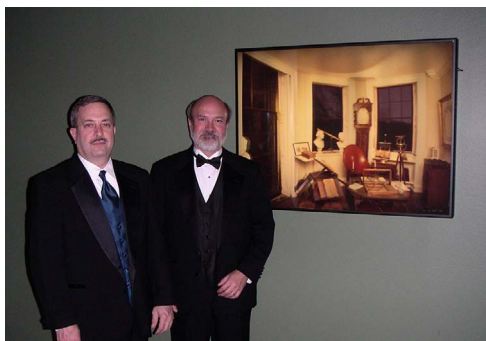
Figure 6. The Jefferson's Cabinet stereogram was built in collaboration with (art) n . As users approach this 1m by 0.75m exhibit, the barrier layer causes the eyes to see two different images, creating the stereo effect.