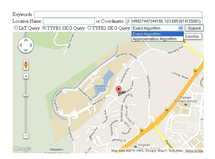
Figure 2: Desktop/Laptop Interface

Next, the keyword only covered by the furthest object in this group is found. Each object containing such a keyword is checked in ascending order of its distance to the query. On each of them, a new query is formed and issued with the location of that object and the keywords of the original query. The nearest object for each keyword in the query to this object is then retrieved, and the cost of this group with regard to the original query is computed. Finally, the group with the best cost is returned.