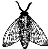
Figure 2: A sample black and white graphic (.pdf format) that has been resized with the includegraphics command.

As was the case with tables, you may want a figure that spans two columns. To do this, and still to ensure proper “floating” placement of tables, use the environment figure* to enclose the figure and its caption.