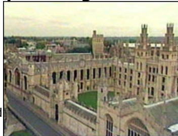
Oxford moves up to joint second

Four of the top 10 are British and the rest American. Harvard is top and Yale, Oxford and Cambridge joint second.