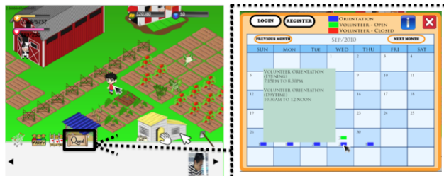
Figure 1. Screenshots of Farmer's Tale : game scene (left) and volunteer quest calendar (right).

In this paper, we took a different approach. Instead of designing a persuasive game for volunteerism from scratch and evolving the game play mechanics around the target behavior, we modeled our game “ Farmer's Tale ” (Figure 1) ( apps.facebook.com/farmerstale ) after an existing popular game on Facebook called Farmville . We inserted persuasive elements into the game by having a quest system which links virtual tasks to real world volunteer activities.