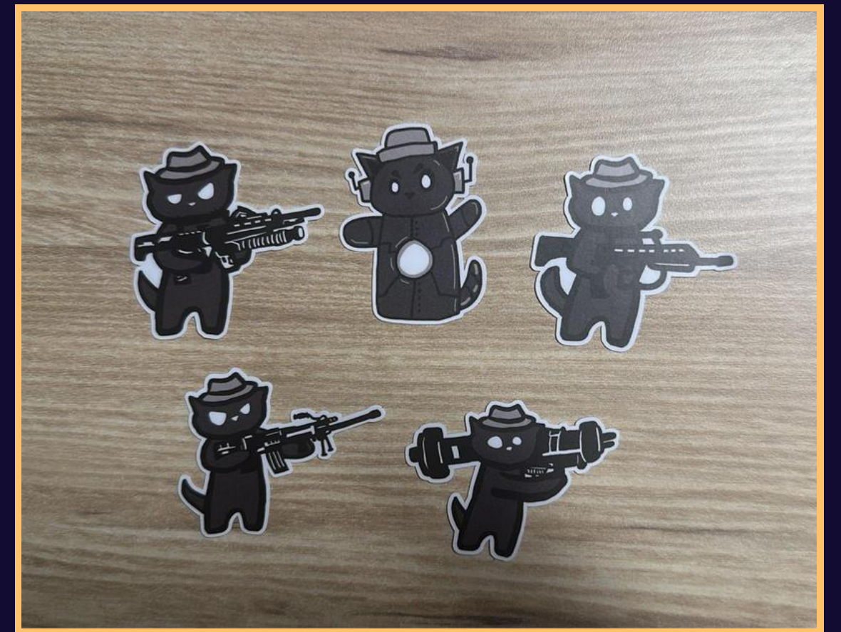
Greyhats stickers from their WelcomeCTF (2026)!