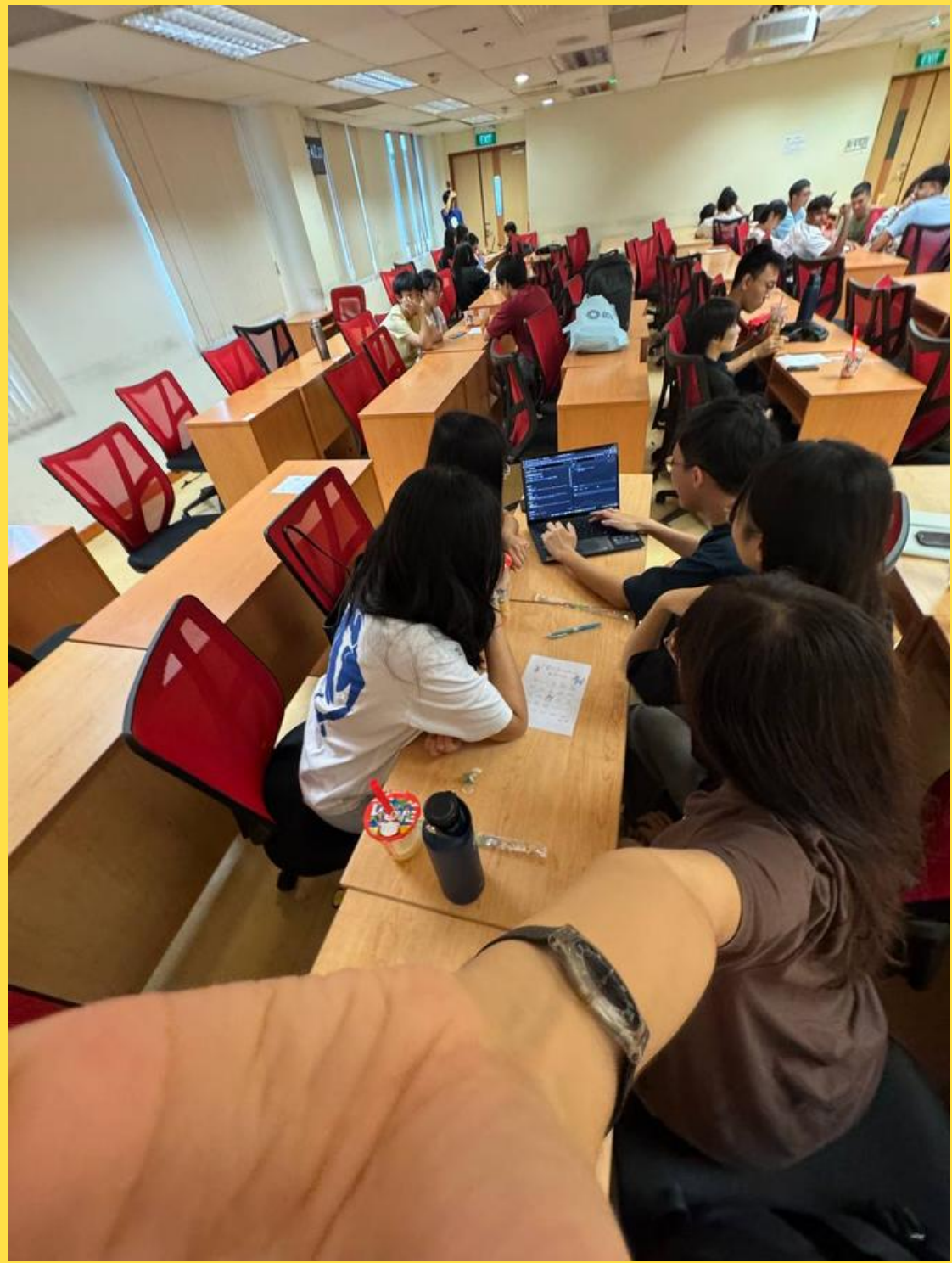
Doing LeetCode together! Playing foosball at PitStop@COM! COMaraderie 2026