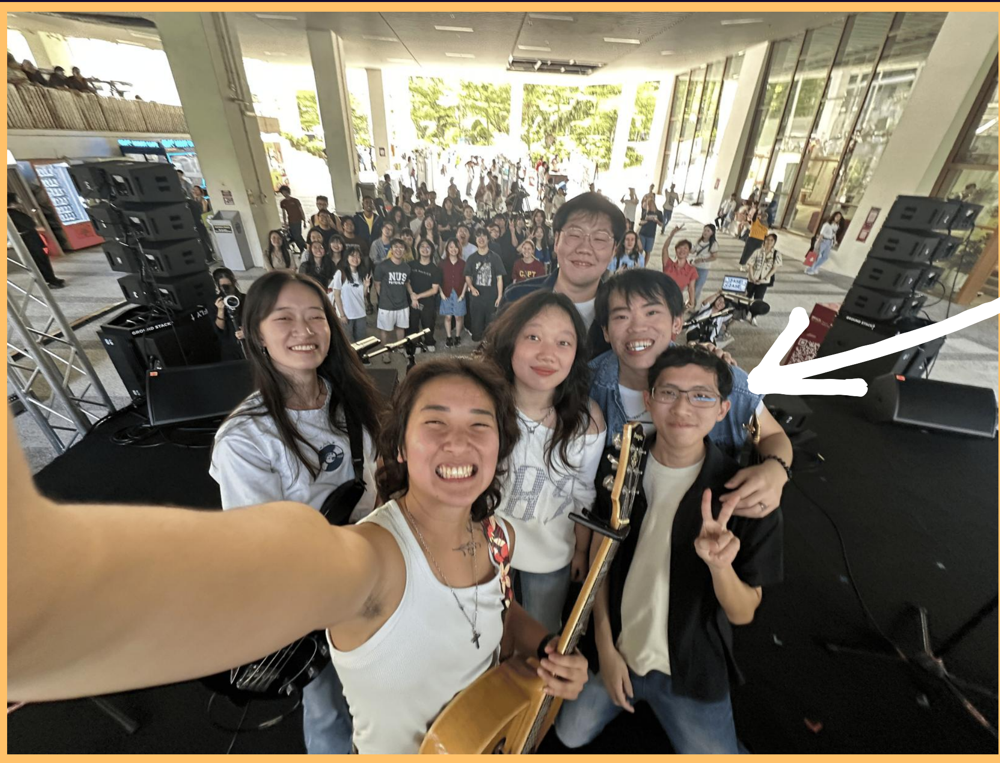
Overdrive concert @ Central Library Forum (2026) ft. code-switch