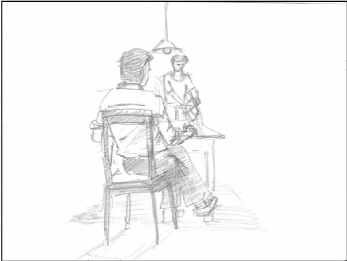
Figure2. At the end of deal money and photo was handed over to the perpetrator. (Over the shoulder shot)