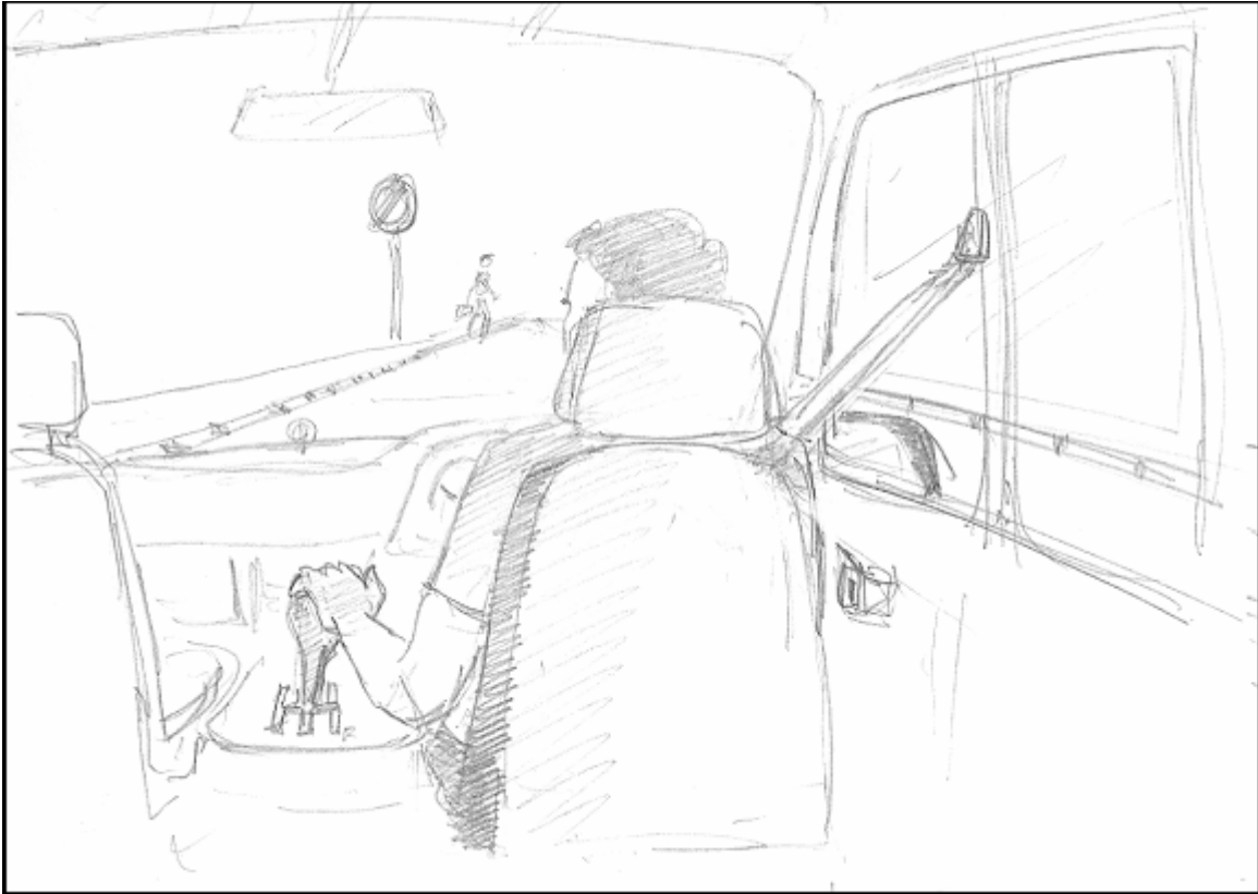
Figure3. The assassin was informed about the daily rout of the target person and wants to perform a hit and run case. So there the target comes about to cross the road. (Over the shoulder shot)