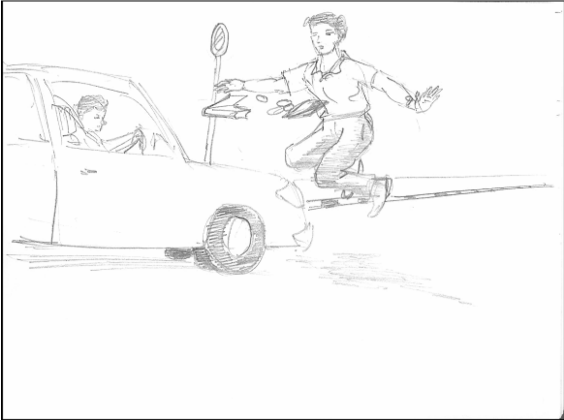
Figure7. Time freeze action still continues. (Camera moved to side view, wide shot)