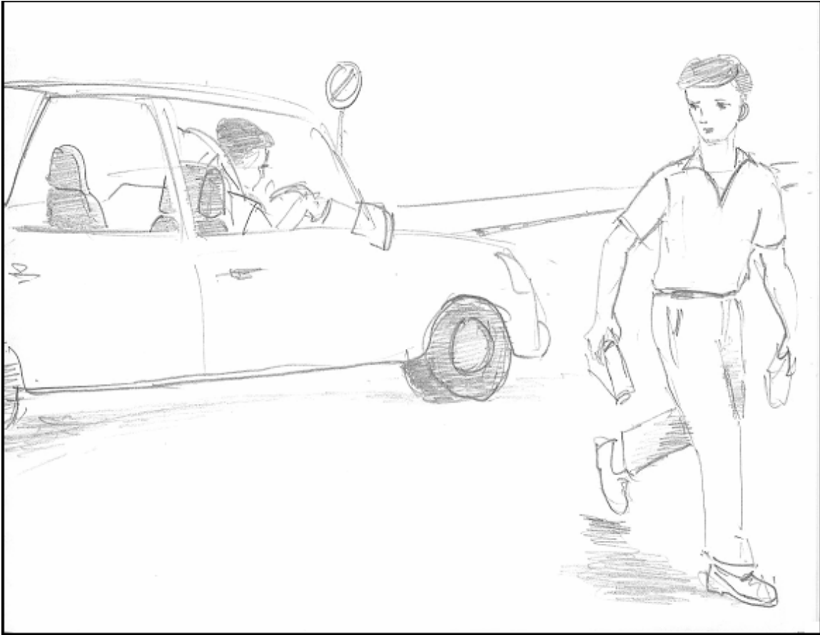
Figure9. The protagonist walks away from the view and the time frozen stops. The car passes by in the same speed it had approached (Wide shot)