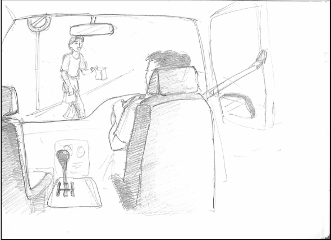
Figure4. The car zooms on the target. (Over the shoulder shot)