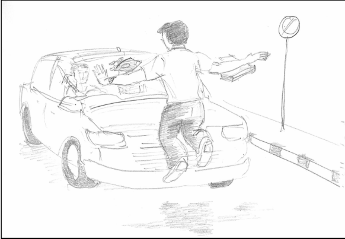
Figure6. The time is still frozen. (Camera pans around the frozen scene)