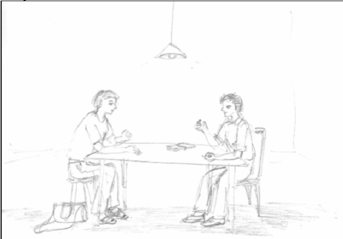
Figure1. Two people are trying to get rid of a guy as soon as possible. A deal was struck. (Discussion done in the dark of night high contrast scene)