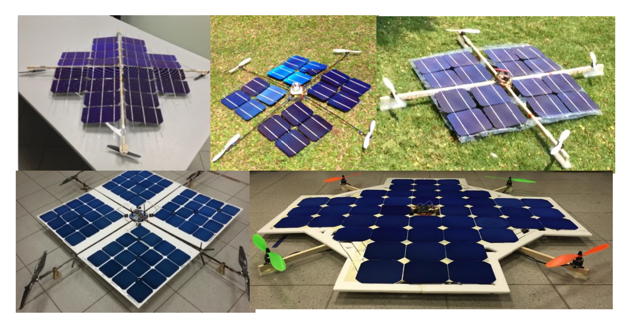
Figure 2: Iterations of the solar aerial vehicle (clockwise from top left) by completion date: 2012 (12 cells), 2013 (16 cells), 2014 (16 cells), 2015 (48 cells), 2016 (64 cells).

The project involves multidisiplinary design skills, touching on computing/control, mechanical engineering (frame design, motor selection), wireless technology, solar cell integration and maximum power point tracking, power systems design, and engineering project management and teamwork. Although a challenging project, students are highly motivated. Attempting a world-record goal stated in clear and simple terms, working in a motivated and interdisciplinary team of fellow students, working with a project that can be easily understood to non-technical people, and having tools available to make meaningful progress are all hallmarks of a sought-after "popular" final year project. Starting in 2016-2017, we have moved this project to the "Design Centric Curriculum", where students from various engineering disciplines can work together on an engineering project.