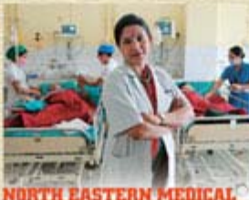
NORTH EASTERN MEDICAL RESEARCH INSTITUTE Best SME in Northeast India