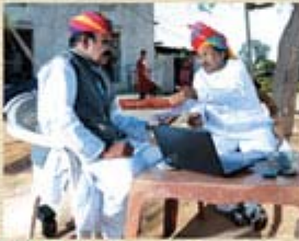
STARAGRI Star SME Agriculture (Small)