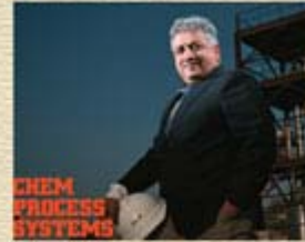
CHEM PROCESS SYSTEMS Star SME Manufacturing (Medium)