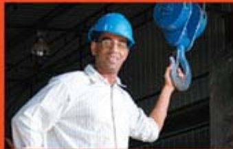
ANKUR SCIENTIFIC ENERGY TECH. Star SME Overall (Small) Star SME Manufacturing (Small)