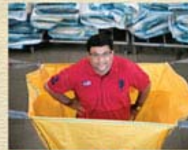
EMMBI POLYARNS Best SME for Innovation (Medium)