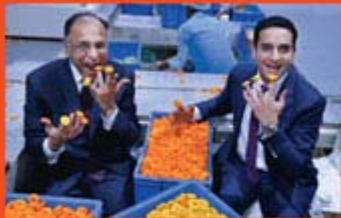
DFM FOODS Star SME Overall (Medium) Star SME Agriculture (Medium)