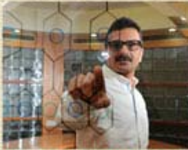
MOLECULAR CONNECTIONS Best SME for Innovation (Small)