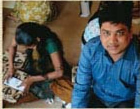
SL PACKAGING Star SME Trading (Small)