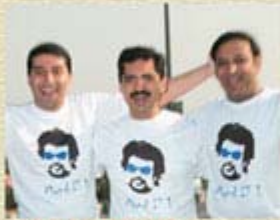
MYND SOLUTIONS Star SME Services (Small)