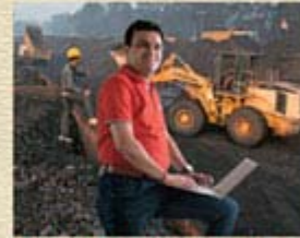
AASTHA MINMET INDIA Star SME Trading (Medium)