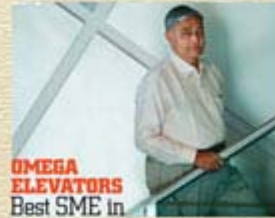
OMEGA ELEVATORS Best SME in Social & Environmental Responsibility (Medium)