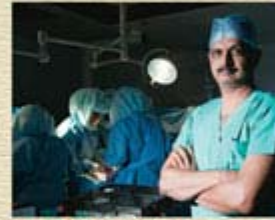
SHALBY HOSPITALS Star SME Services (Medium)